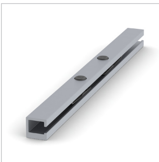
Fast and easy extension of a aluminium profile. 609QF is mounted fast as a flash.