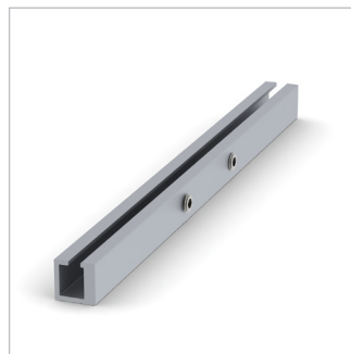
Stronger version of 609QF. Mounted with screw instead of push button. More suitable for permanent installations.