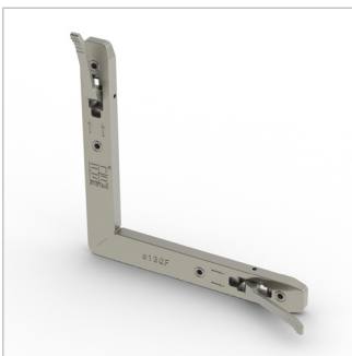
Fast and easy assembling of aluminium frames. 613QF is mounted in a second.