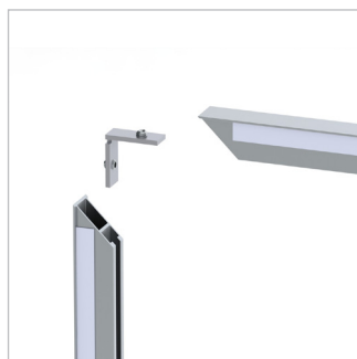
Profile 91B is connected with 611.