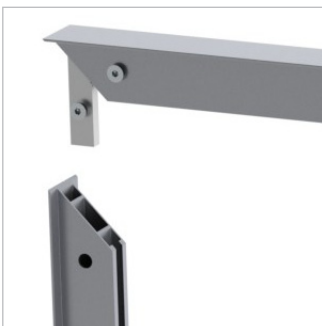
Mitred frame with coupling 614.