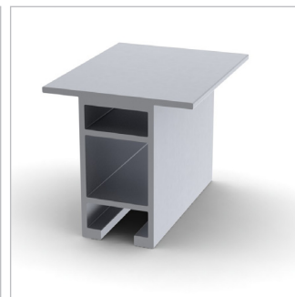
Profile 92B is for double sided graphics.