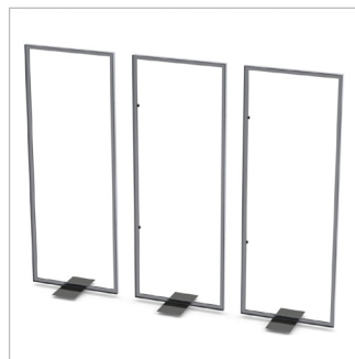
Walls in profile 92B for stand building.