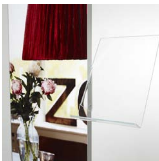
Brochure rack is an accessory.