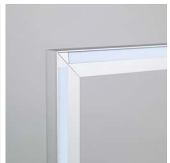
Stell tape added on the frame in aluminium.