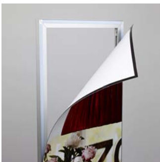
The picture attaches easily with magnetic tape.