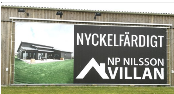
The rigid construction allows large image dimensions with widths up to 12 meters. Over 6 meters 2 cranks are needed.