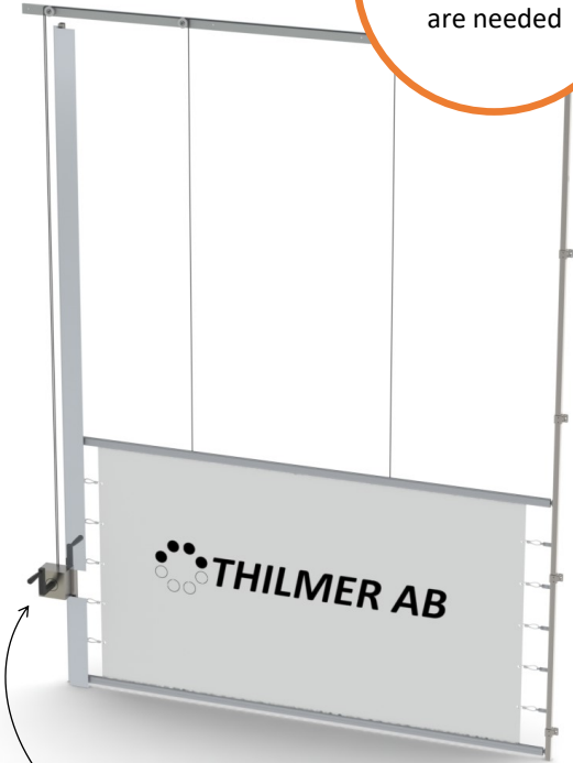
The crank is detachable and with an adapter (not included) you can operate SMART-Lift with an electric screwdriver